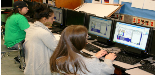
Teachers at Laboratory School of Finance and Technology complete 'Write to the Point' activity from a student perspective

Take a look at these snapshots to see how Urban Tech is training participating teachers to successfully implement Get Healthy, Get Smart! in their school communities.