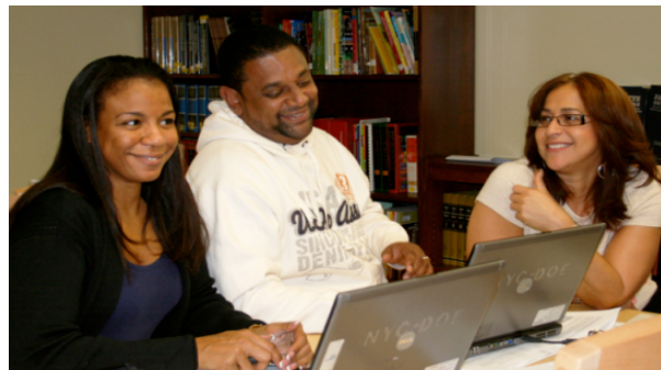
Teachers from Antonia Pantoja Preparatory Academy share classroom experiences related to training content