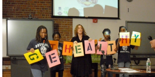
FDA-I 6 th Grade students showcase their Get Healthy tips and health facts.