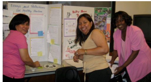
Teachers exhibit and analyze their students' work at a professional development workshop.

There is no doubt that teachers and administrators have limited time for professional and curriculum development. To address these challenges, the Get Healthy, Get Smart program has included time-saving curriculum instruction and technology training, PLUS links to Academic Standards for Math, Science, Language Arts and Health. Direct feedback from our partner schools indicated that success starts by investing in the teachers and their on-going learning process. Each month, teachers and administrative staff join Urban Tech and facilitators from Bank Street College for professional development workshops. This provides valuable time for facilitation tips, trouble-shooting, sharing of best practices, creative extension ideas, networking with community and professional resources, and celebrating success stories. There are also site visits conducted monthly for each participating teacher!